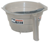
FUNNEL W/DECALS, WIDE-SMOKE