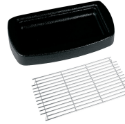
DRIP TRAY KIT, ITB W/2 TDO-N-3.5