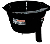
FUNNEL ASSY,BLK- CENTER OUTLET