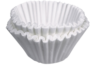
FILTERS TEA/SYS2 500PK/1 50/CL