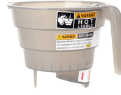
FUNNEL ASSY, TEA