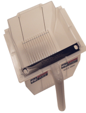
POUCHPACK FUNL ASSY,TEA Q-T